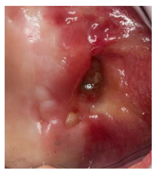
Figure 1. Oroantral fistula viewed 21 days after the sinus lifting procedure.

Clinical evaluation after 30 days showed complete healing and epithelization at the donor site; maintenance of buccal sulcus depth; an abundant band of keratinized mucosa over the grated area; and total closure of the oroantral fistula, which could be verified through a negative Valsalva maneuver (figure 6).