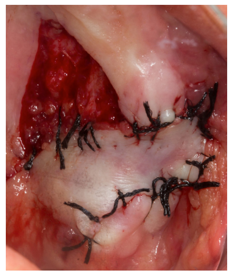
Figure 5. Fistula completely sutured.