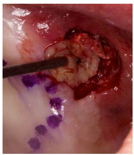
Figure 2. Complete dissection of the fistula walls.