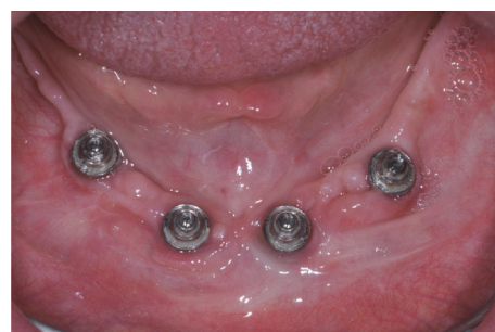
FIGURE 3: Plaque accumulation on the prosthetic components after 30 days of installation of definitive prostheses.

(Impression Coping Micro Unit Abutment, Conexão Sistemas de Prótese, São Paulo, Brazil) and occlusal records were performed on the multifunctional guide. Heat-polymerized polymethyl methacrylate resin (Lucitone 550, Dentsply International Inc., New York, USA) was used for manufacturing the maxillary complete denture and mandibular fixed implant-supported prosthesis. Afterwards, both prostheses were installed and the fitting and adaptation were checked. (Figure 2).