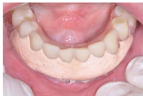
FIGURE 7: Surgical cement in the recipient bed and stabilized on the mandibular prosthesis.