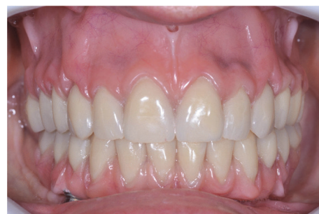
FIGURE 2: Checking the fitting of prostheses in mouth.

All procedures for manufacturing of a new conventional maxillary complete denture in combination with a mandibular fixed implant-supported prosthesis were used. A record base with an occlusion rim was used to reestablish occlusal planes and the occlusal vertical dimension and record patient's centric relation. Afterwards, the definitive casts were mounted in a semiadjustable articulator and artificial acrylic teeth were set and after evaluated in the patient. A mandibular multifunctional guide was manufactured for definitive impression and occlusal registration. Four miniabutments (Micro Unit Abutment, Conexão Sistemas de Prótese, São Paulo, Brazil) were installed on the implants and the impression was performed using impression coping