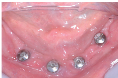
FIGURE 1: Initial appearance of the gingival tissue around the implants.

of KM using a mandibular fixed implant. Thus, the aim of this clinical case report is to describe an oral rehabilitation procedure of an edentulous patient with absence of KM in the interforaminal area, using a free gingival graft associated with a mandibular fixed implant-supported prosthesis.