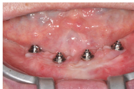
FIGURE 8: Six months of follow-up after surgery showed a good health of peri-implant tissues and absence of plaque accumulation.

After a 6-month period of follow-up (Figure 8), it was observed an improvement of thickness and a 3 mm increase in the height of keratinized mucosa, promoting a good peri-implant health and facilitating the hygiene procedures. After one year of follow-up, the patient reported being satisfied with the treatment and an improvement in the ease of cleaning the mandibular prosthesis without any complaint of painful symptoms in the peri-implant area.