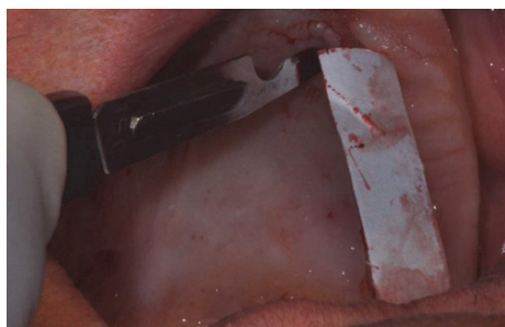
FIGURE 5: A sterile paper to make a map with the size of the recipient bed and transferred to the palate.

Johnson do Brasil, São José dos Campos, Brazil) to remain stable and in close contact with the periosteal bed. The same protocol described above was applied to the second portion of the graft on the right surgical area (Figure 6).